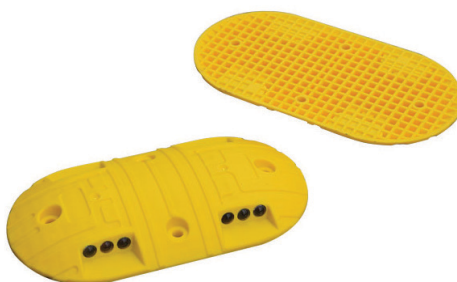
Size: 220L x 120W x 20Hmm