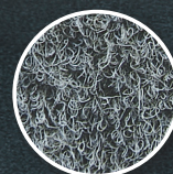
Slate Grey (Carpet)