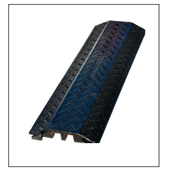
CPDROP2 - up to 10 cables

• Ideal for office, school and factory/warehouse walkways • Simply drop over cables • 1.0 metre long interlocking modules