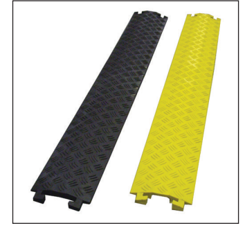
CP12 - up to 5 cables